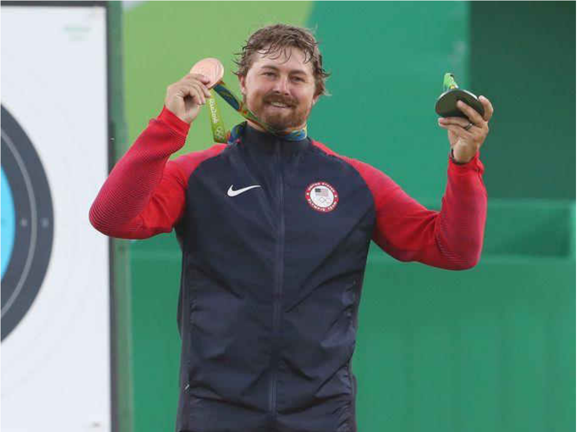
Brady Ellison and his Bronze Medal in Men's Individual Archery - Rio