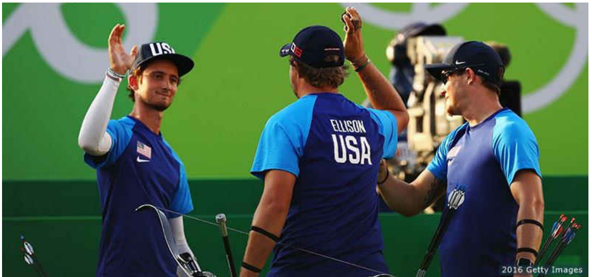
USA Archery Team wins the Silver Team Medal in Rio