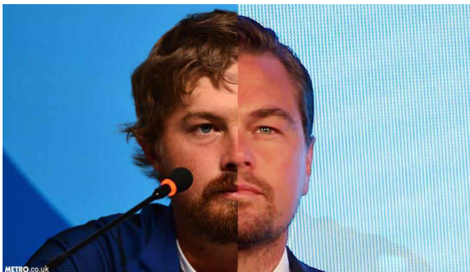
Brady and Leonardo (Archer and Fan) – Movie perhaps?