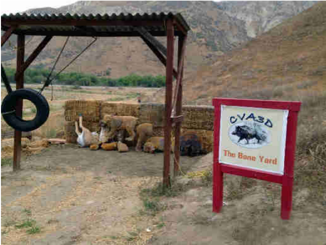
The Bone Yard

I can't think of better addition to our 3D Range than a Hawk & Knife Throwing Station . Safer than a game of Horse Shoes, Hawk & Knife throwing is an enjoyable and exciting pastime that dates back to the Colonial Period. At first glance, the distance may seem short. But, the standard distance is based on one complete revolution of the hawk – about five paces.