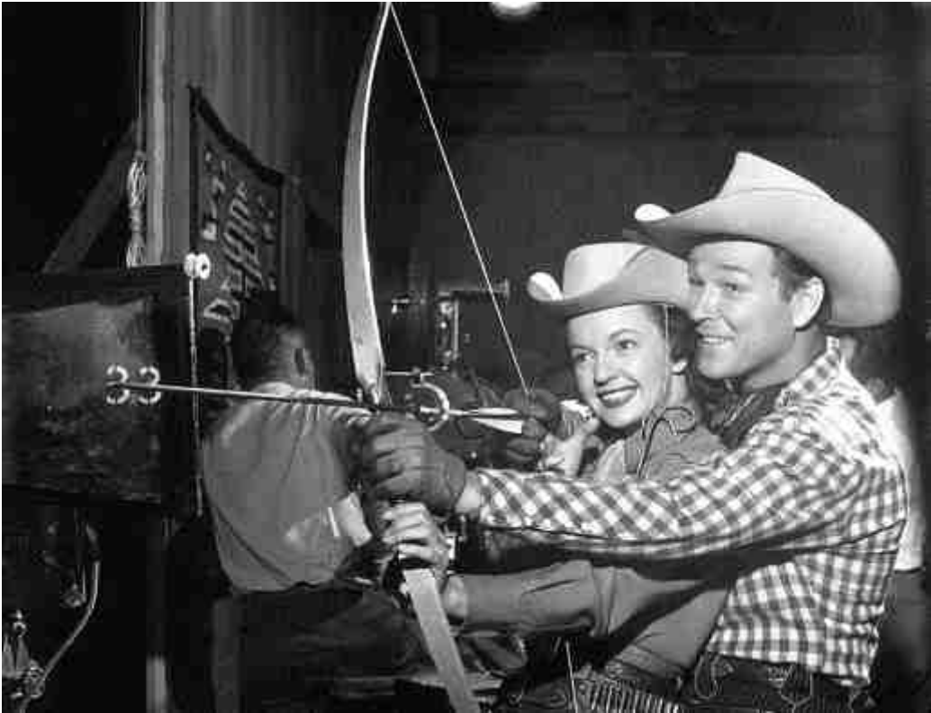
Roy and Dale of course