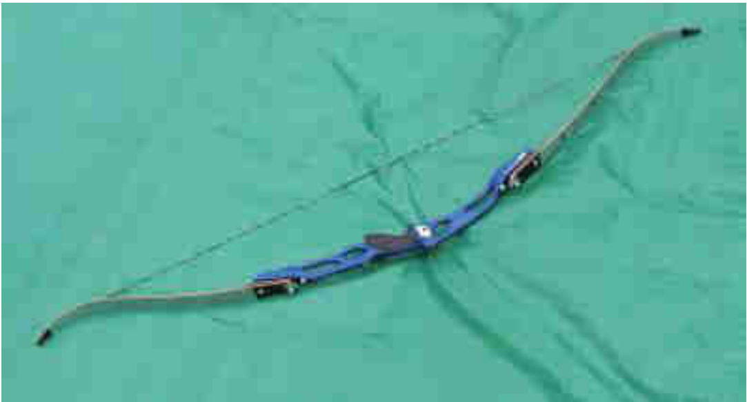
Sebastien Flute recurve bow, left hand, for sale