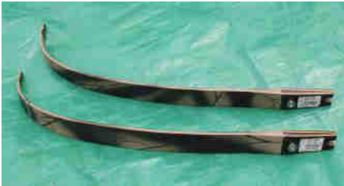
Windstorm (Win&Win) ILF lcarbon-maple limbs for sale

Windstorm (Win&Win) ILF lcarbon-maple limbs. I painted the pattern. On a 25" riser, these are 44# making a 66" bow, on a 23" riser, they are 46# making a 64" bow. Adjustable ILF risers allow for +/- 3# adjustment. They are in good shape except for the paint that came off when hanging the bow. Asking $ 130.