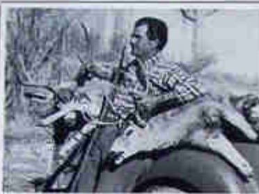
Above is a picture of the world famous Howard Hill with some of his finest archers. Howard Hill is now running the Howard Hill Productions in Southern, Utah, and there will have a complete line of the finest archery goods for the hunter.