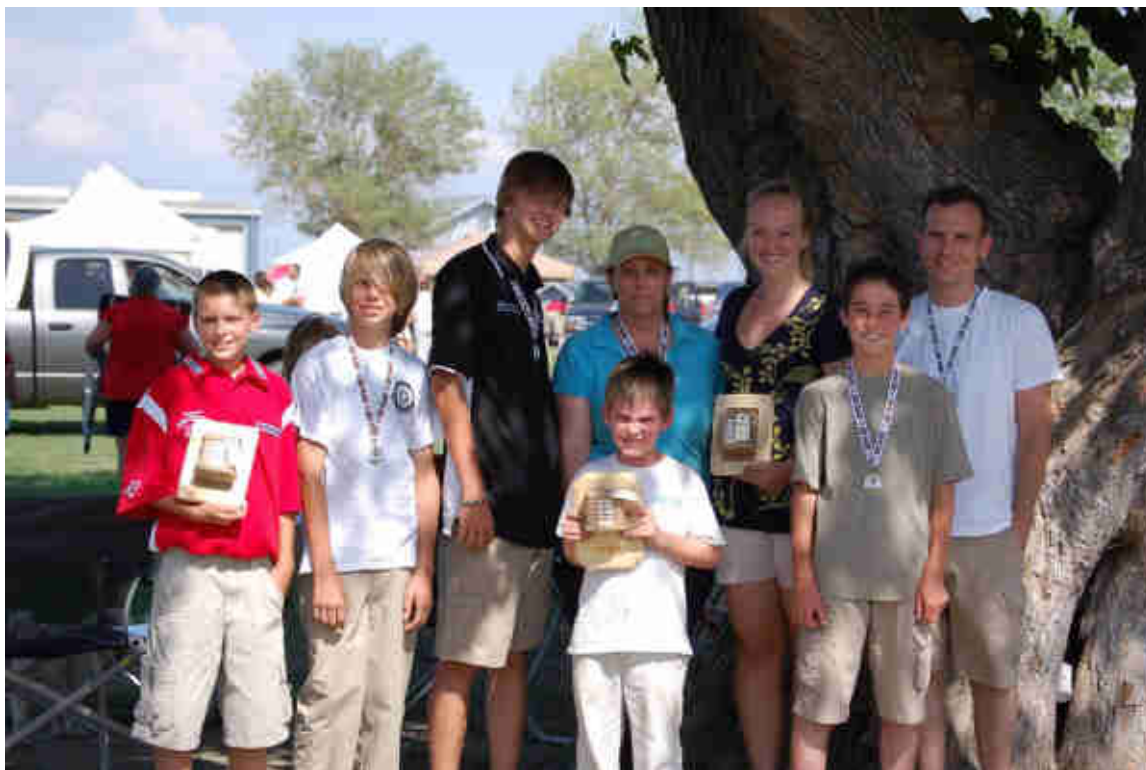
Cotton Bowl Tulare 2009