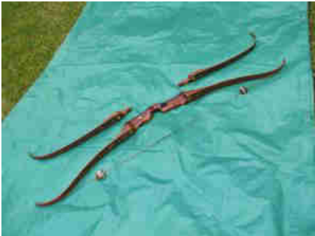
Black Widow MA-V Ironwood recurve bow for sale

CONTACT: Terry Hogan, bthogan@cox.net . Will personally deliver if in So. Cal.